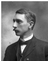
A.B. Graham Founder of 4-H

Health Physical and personal development.